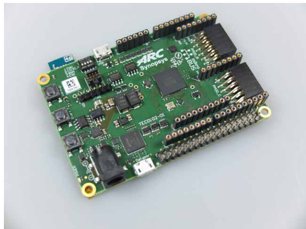
Figure 1: ARC IoT Development Kit hardware

The DesignWare® ARC® IoT Development Kit includes a silicon implementation of the ARC Data Fusion IP Subsystem as well as a rich set of peripherals commonly used in IoT designs such as Bluetooth, USB, analog-to-digital converter (ADC), pulse width modulator (PWM) and on-board 9-axis sensor. The IoT Development Kit is supported by Synopsys' ARC MetaWare Development Toolkit, which includes a compiler, debugger and libraries optimized for maximum performance with minimal code size. In addition, the embARC Open Software Platform gives developers online access to device drivers, application examples and a suite of free and open-source software that speeds software development for ARC-based embedded systems.