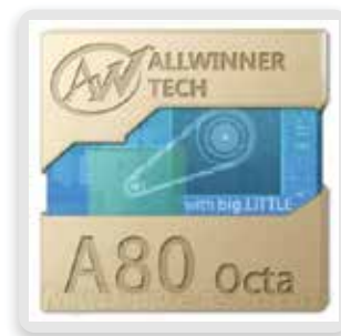
Figure 1: Allwinner Technology A80 Octa System-On-Chip

Since its founding in 2007, Allwinner Technology has released multiple mobile application processors, largely implemented in Android-based smartphones, tablets, internet boxes and set-top boxes. Allwinner Technology needed a solution capable of high performance hardware and software validation for their A80 Octa architecture, an eight core SoC based on ARM's big.LITTLE processing technology. The A80 Octa SoC represents two heterogeneous ARM cores, consisting of quad core Cortex-A7 and Cortex-A15 processors in a big.LITTLE configuration, to deliver a design that optimizes high-performance and low-power in phones, tablets and other mobile devices. For increased performance resolution, the A80 design is also paired with a GPU core.