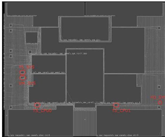
Figure 3: Placement of Synopsys temperature sensor, voltage monitor, and process detector IP within the Morello CPU architecture

With guidance from Synopsys, Arm instantiated 3 temperature sensors, 4 voltage monitors, and a process detector into the Morello SoC. The application software was then enabled to use the temperature sensors to measure the temperature of the CPUs. If the temperature goes beyond a configurable warning threshold, the software issues a warning and if the temperature goes beyond a configurable critical threshold, the software initiates a shutdown for the device. The temperature sensors are used in uncalibrated mode allowing an accuracy of +/- 4 °C. If calibrated during test the temperature sensors are capable of providing an increased accuracy of +/- 1.2 °C.