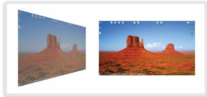
Figure 1. Side and front display views

Most displays, while there is uniform color and brightness when viewed on-axis, have degraded image quality as the viewer moves off-axis. The color and brightness performance must be studied and optimized as a function of viewing angle, requiring novel OLED geometries and materials, possibly including nano-textures. The RSoft™ FullWAVE™ and LED Utility™ tools are ideal solutions for this design challenge.