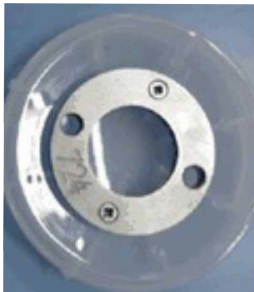
Figure 1: Picture of the sample (Window diameter = 20 mm ; Window Thickness = 1,5 mm)

The sample (window) is made of SiO 2 . The window is within a metal frame. The surface roughness of the window is in the range of 3nm to 1,5nm.