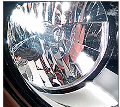
Figure 2: Final H4 product example