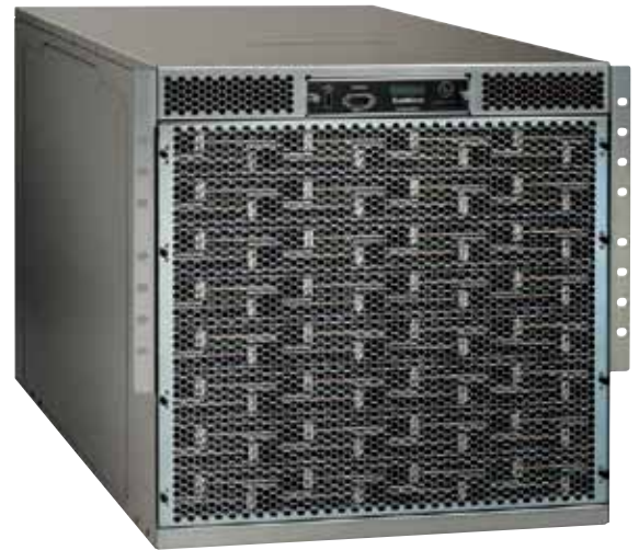
The SeaMicro SM10000-64 Server has 2,048 CPU cores per rack and provides the first server architecture that can support any CPU instruction set.

SeaMicro is a venture backed by Khosla Ventures, Draper Fisher Jurvetson and Cross Link Capital. More information about SeaMicro can be found at http://www.seamicro.com .