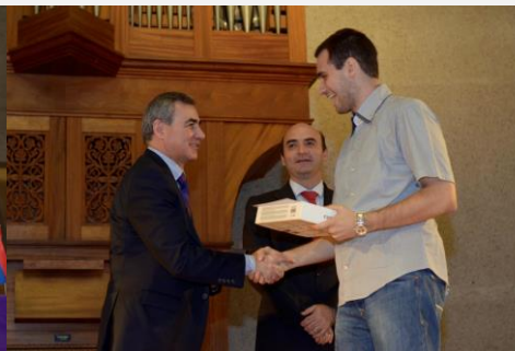
The 3 rd prize winner from Serbia