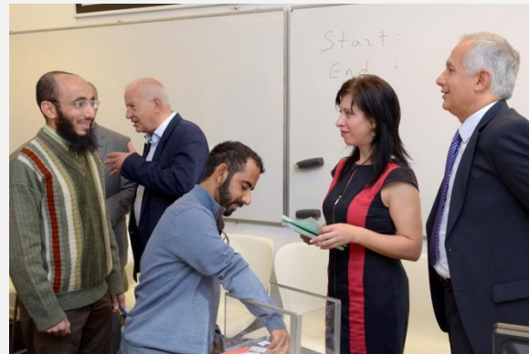
Drawing of the tests