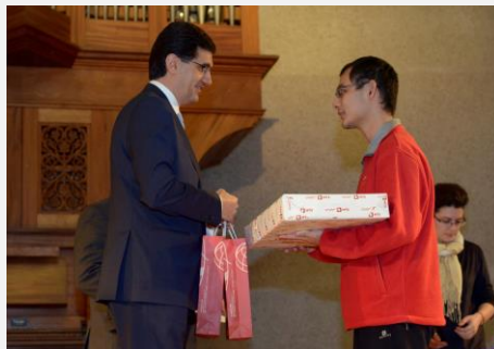
The 1 st prize winner from China