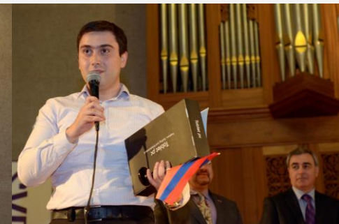
The 3 rd prize winner from Armenia