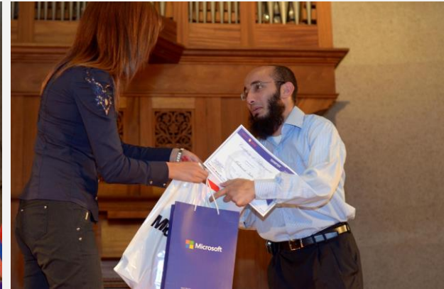
The Most “out-of-box” Solution prize winner from Saudi Arabia