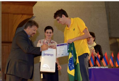
The 2 nd prize winner from Brazil