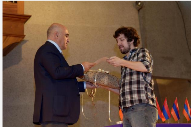
The Most Creative Solution prize winner from Argentina