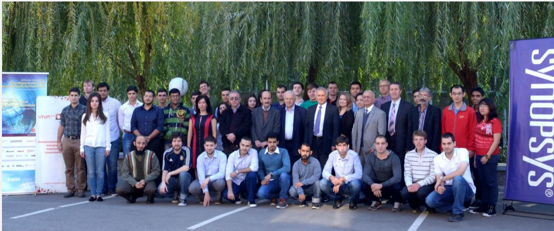
The Olympiad final stage participants and the Program Committee

(Venue: Synopsys Armenia Educational Department and R&D Center) October 15, 2013