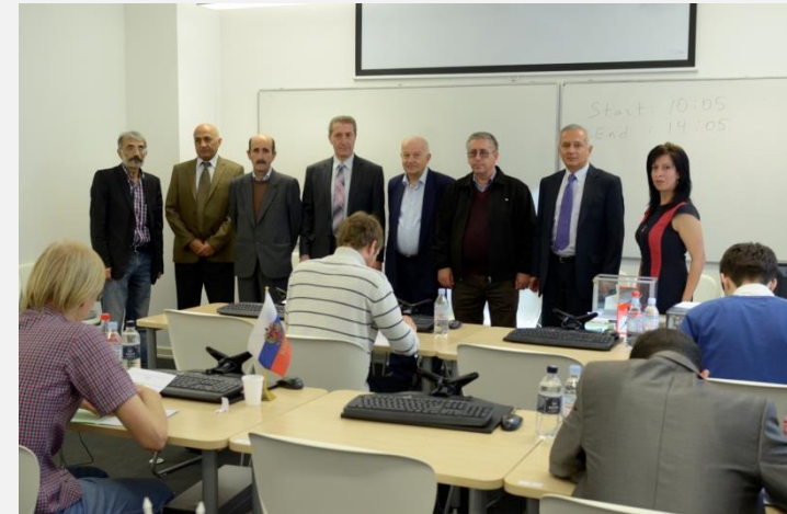
The Olympiad Program Committee