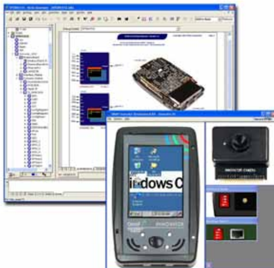
Figure 2: Synopsys VPOM-1610 debugging security peripherals.